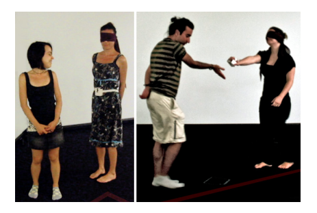
Figure 3: Workshop participants engaged in their task

The awareness of the presence of the GP was directly affected by the placement of the EC. When the EC moved physically closer to the GP's body, the BP's awareness of the GP increased. In general, the EC provided a proximity-based representation of entities to the BPs; however, the association of this representation to individual entities depended on the physical distance between the entity and the EC. The association of a representation with the entity was at a maximum when the EC was physically attached to said entity and at a minimum when the EC was carried by the BPs. From this point of view, distributing ECs could increase the participants' awareness of space and of the other entities in that space.